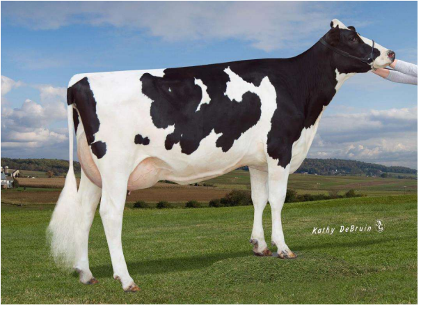
MGD: Endco Yoder L7933 9839-ET VG-86