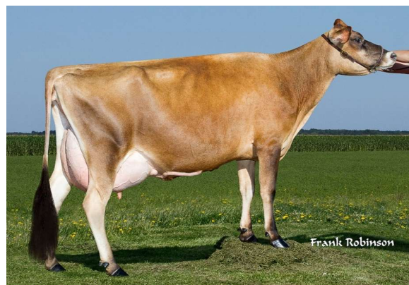
MGD: Ahlem Legal Charm 35767 VG-87%