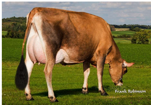
DAM: Ahlem Viper Charm 47521-ET VG-87%