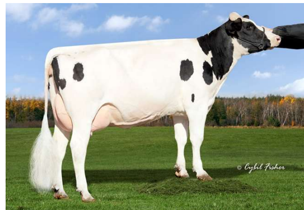
MGD: Kings-Ransom It Distinct-ET VG-88