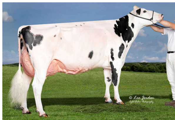
DAM: Kings-Ransom KB Delicate-ET EX-93 (3rd Lactation Photo)