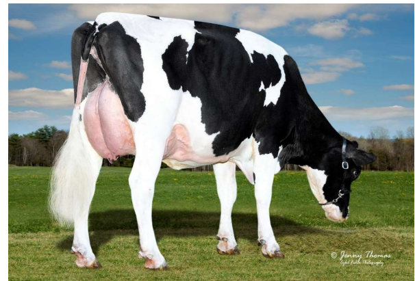
Dam: G-E-Koetsier Rubcn 9014-ET VG-85