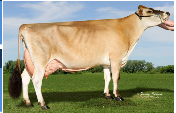
Dam: Valsigna Viceroy 31849 VG-86%