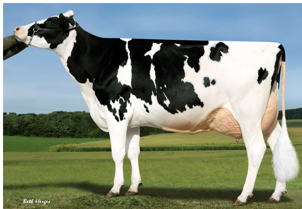
MGGD: Sandy-Valley Yoder Evy-ET VG-85