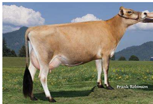
DAM: Sunset Canyon Impuls L MAID 4