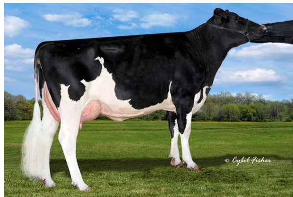
MGD: Welcome Supersire Gales-ET VG-86