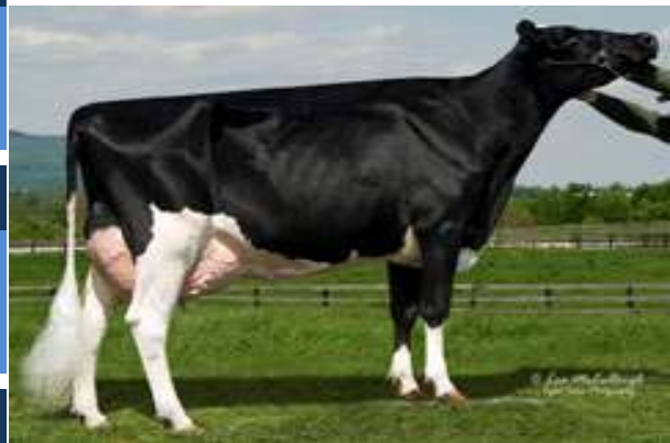
Same Family: RC-LC Goldwyn ATM EX 92 03-10 2x 365D 37630M 4.9 1848F 3.3 1223P