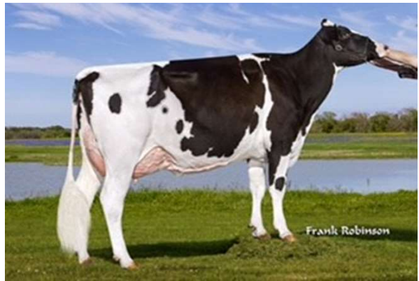
DAM: Hilmar McCutchen 7009 EX-91