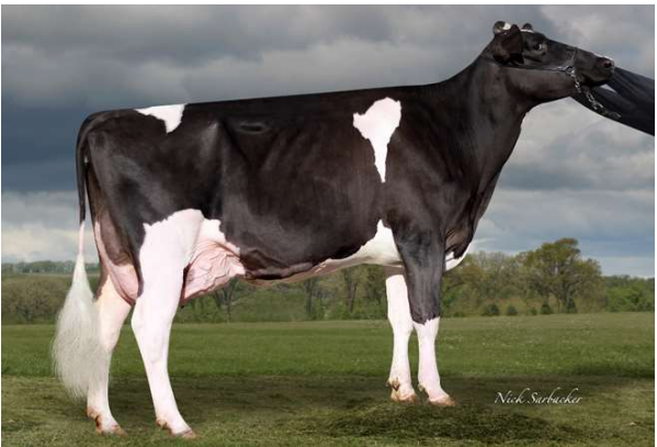
MGD: Hilmar Robust 4929-ET VG-87